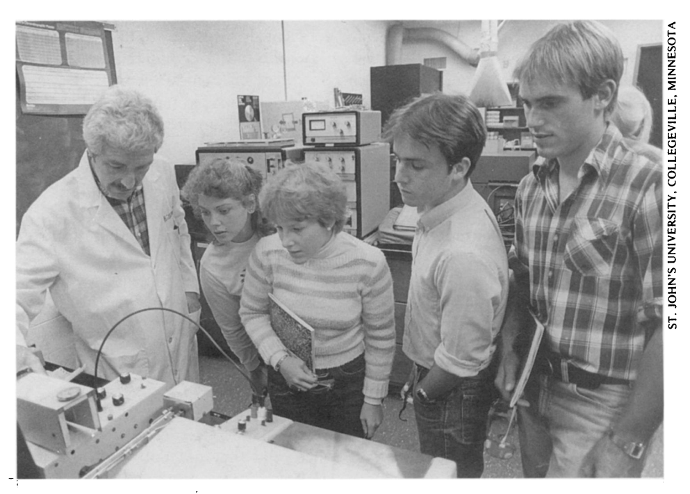
Teacher as facilitator