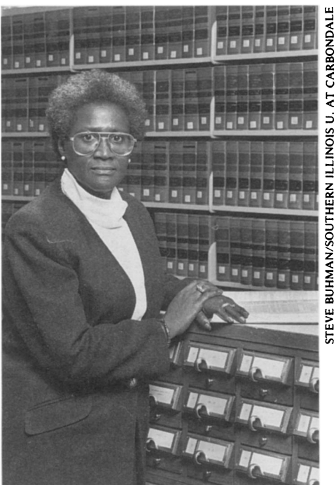
Teacher as formal authority

For example, in one study students were randomly assigned to two sections of the same course. One group was taught using teacher-centered methods for two semesters. Thus the expert/formal authority blend of styles prevailed.